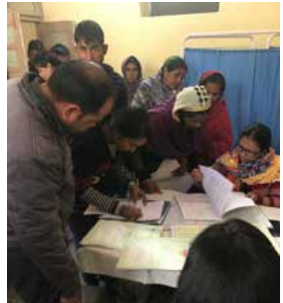
ASHA'S AND MEDICAL STAFF GETTING THEIR CLIENTS REGISTERED.

the associated risks of the surgery or the necessary post operation procedures and care. It was not evident that the threshold of informed consent was being met. The team was informed that sterilization camps were conducted every Monday with an average of 10-12 procedures being conducted. A male nurse mentioned that the maximum number of patients at a sterilization camp was 20, while another doctor at the CHC stated that there may be up to 30 women at a camp. The fact finding team was informed that the medical team (which included a surgeon, a nurse and supporting staff from Bhilwada District Hospital) conducted the sterilization camps. The doctor kept inquiring about the no. of women who had come for operation. The seriousness of filling up the forms can be assessed from the fact the nurse asked social activists to fill up the forms when she had to leave her desk for a few minutes.