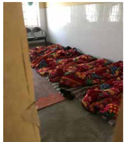
WOMEN LYING ON FLOOR AFTER GIVEN ANESTHESIA

One of the team members was invited to observe the counselling sessions. The NGO representative spoke positively about sterilization, thus promoting it. It was unclear if the women had been informed about the risks of the procedure, and they did not appear to be giving informed consent as mandated by the guidelines. The hospital staff and NGO team appeared to consider attendance at the camp as an indication of the patient's consent to sterilization. The camp was scheduled