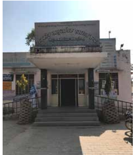
THE CHC AT KHATUSHAMJI

The doctor (general physician) on duty informed the team that the camp usually starts after the doctor has arrived, which is after 12:30 or 1:00 pm. He also stated that there are no gynaecologists in the CHC, Khatushyamji, Rajasthan. 19 women between the ages of 20-30 years were registered for the camps. They had been motivated by their local ASHA workers to undergo the procedure, who accompanied them to the camps along with their family members. A sticker carrying a number was pasted on the back of the women's hands to keep count.