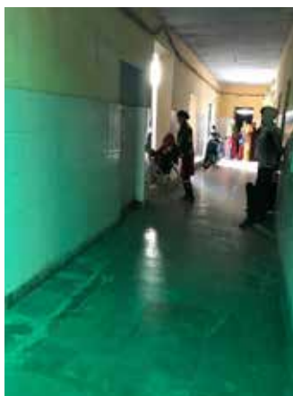
WOMEN BEING CARRIED BACK TO WARD AFTER OPERATION

to occur from 12:30 pm-3:00pm, with the NGO operating team arriving shortly before this. The fact finding team was informed that the procedure would take 4 to 5 minutes, with the women remaining for observation after the procedure for 1-2 hours. This is far less than the government mandated 4 hours of post sterilization observation. 17 women, out of the 19 registered, were operated on. One woman was denied the procedure as she tested positive on a pregnancy test, and the other was denied due to problems with her appendix and the associated risk of the surgery.